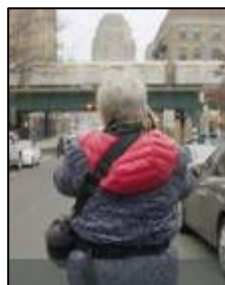
Martha: A Picture Story

The Naked Wanderer Buoyancy Promised Emu Runner Martha: A Picture Story Come to Daddy Honeyland Measure for Measure Vibarium The Wild Goose Lake Deerskin Iron Fists and kung-Fu Kicks For Sama