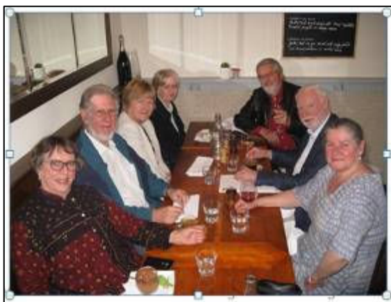
David Stratton meets the FVFS committee.

A few days later David joined the executive committee for a very pleasant lunch in Prahran at Chez Olivier. Discussion ranged from his forthcoming "Film Festival at Sea – Antarctica & South America" and his favourite film festivals, to what is happening in the Australian film society movement and some recommended films.